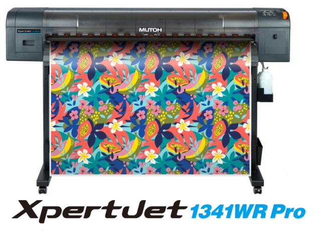
54"/1,371mm wide water-based inkjet printer Single Head / 4 Colors (CMYK)

The XpertJet 1341WR Pro is an ideal printer for trade show graphics, flags, banners, custom interior design, apparel, custom merchandise and more.