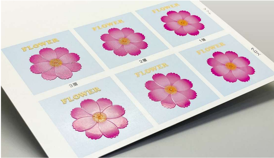
Select a gloss or matte surface finish with one to three layer-thickness